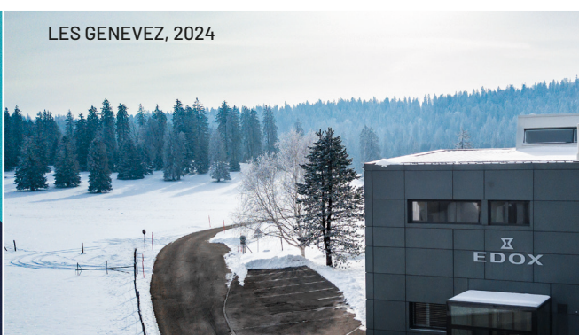
LES GENEVEZ, 2024